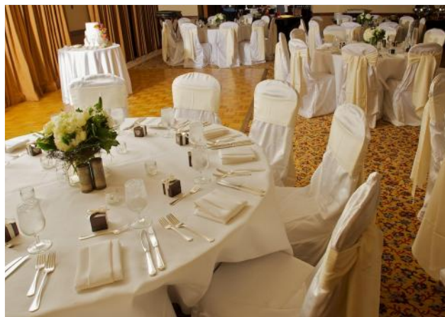
CREEKSIDE ROOM ACCOMMODATES UP TO 60 GUESTS