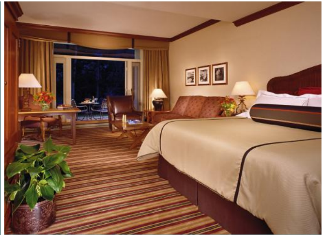
MAIN LODGE ROOM

Conveniently located near the main entrance of the resort, the lobby, library, lounge, restaurant, pool and hot tubs, Main Lodge rooms are spacious and warm, featuring jewel tones and rich wood accents.