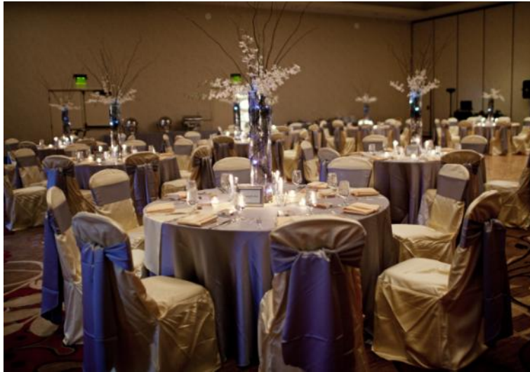
CENTENNIAL BALLROOM ACCOMMODATES UP TO 350 GUESTS