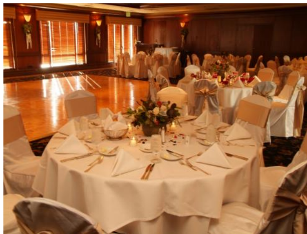
CASCADE BALLROOM ACCOMMODATES UP TO 180 GUESTS