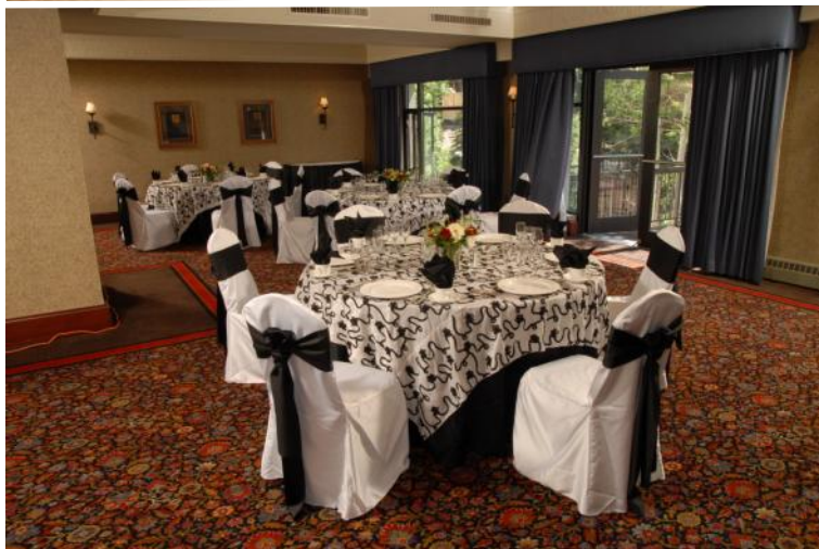
MOUNTAIN VIEW ROOM ACCOMMODATES UP TO 40 GUESTS