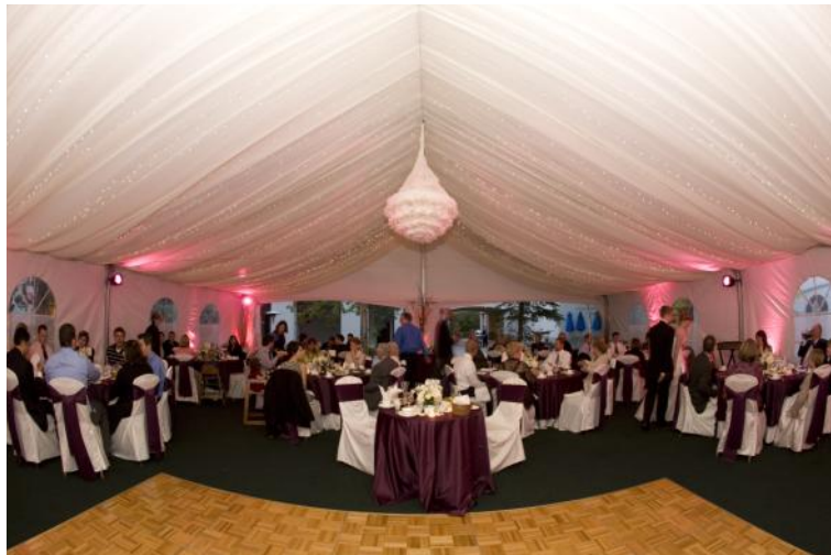
ROCKY MOUNTAIN GARDENS ACCOMMODATES UP TO 230 GUESTS